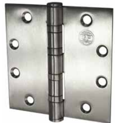
Stainless steel with stainless steel pin