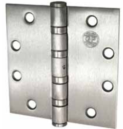
Steel with steel pin